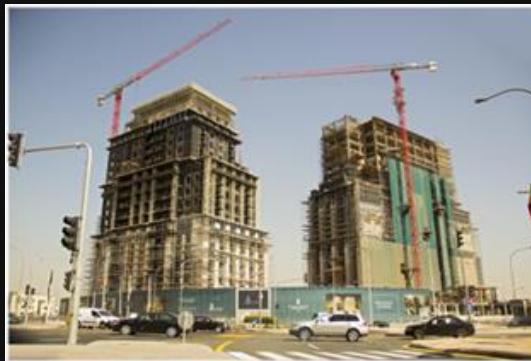
Ritz-Carlton Hotel AMMAN