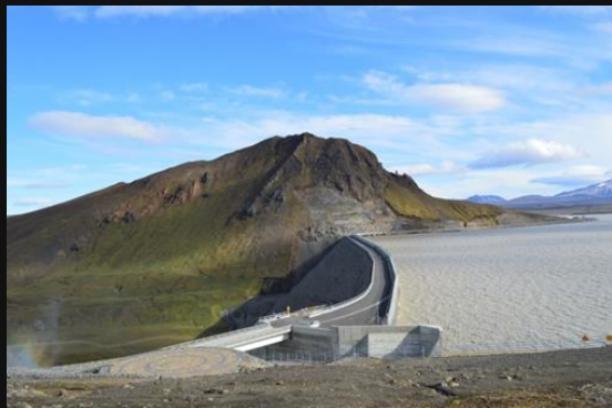
Kárahnjúkavirkjun Hydro Plant ICELAND