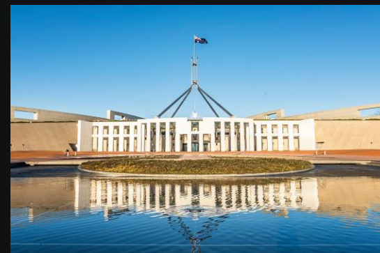
Parliament House AUSTRALIA