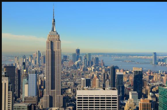
Empire State Building NEW YORK, USA