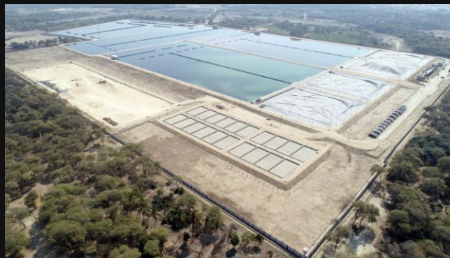
Sewage Treatment Plant San Martín PERU