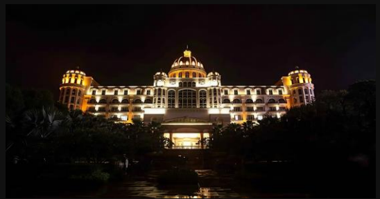
Days Hotel Logan City Huizhou